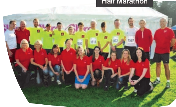
Phillips 2013 Team - Basingstoke Half Marathon