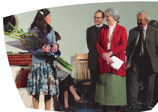
'Murder at the Vicarage' held in July 2012