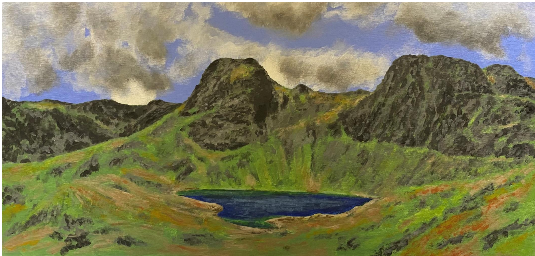
Pavey Ark, Harrison Stickle and Stickle Tarn – Acrylic on canvas. Image size 100cm x 50cm

I have been to Stickle Tarn more times than I care to remember and of course, there is the chance to rise to the challenge of the excellent scramble, Jake's Rake on Pavey Ark – the mountain on the right of the picture. Wonderful!