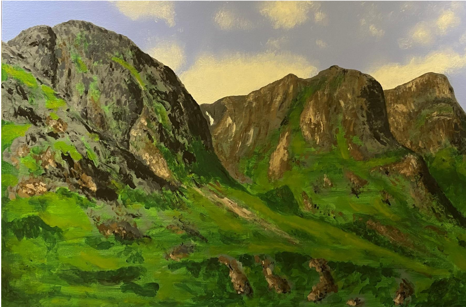
The Three Sisters, Glencoe – Acrylic on canvas. Image size 92cm x 61cm

One summer, many years ago I packed my bag and based on a good forecast, set out on a rare and I think my only solo trip to Glencoe. It was probably one of the best mountaineering trips I have ever had. I met no one and had the mountains to myself. Fantastic!