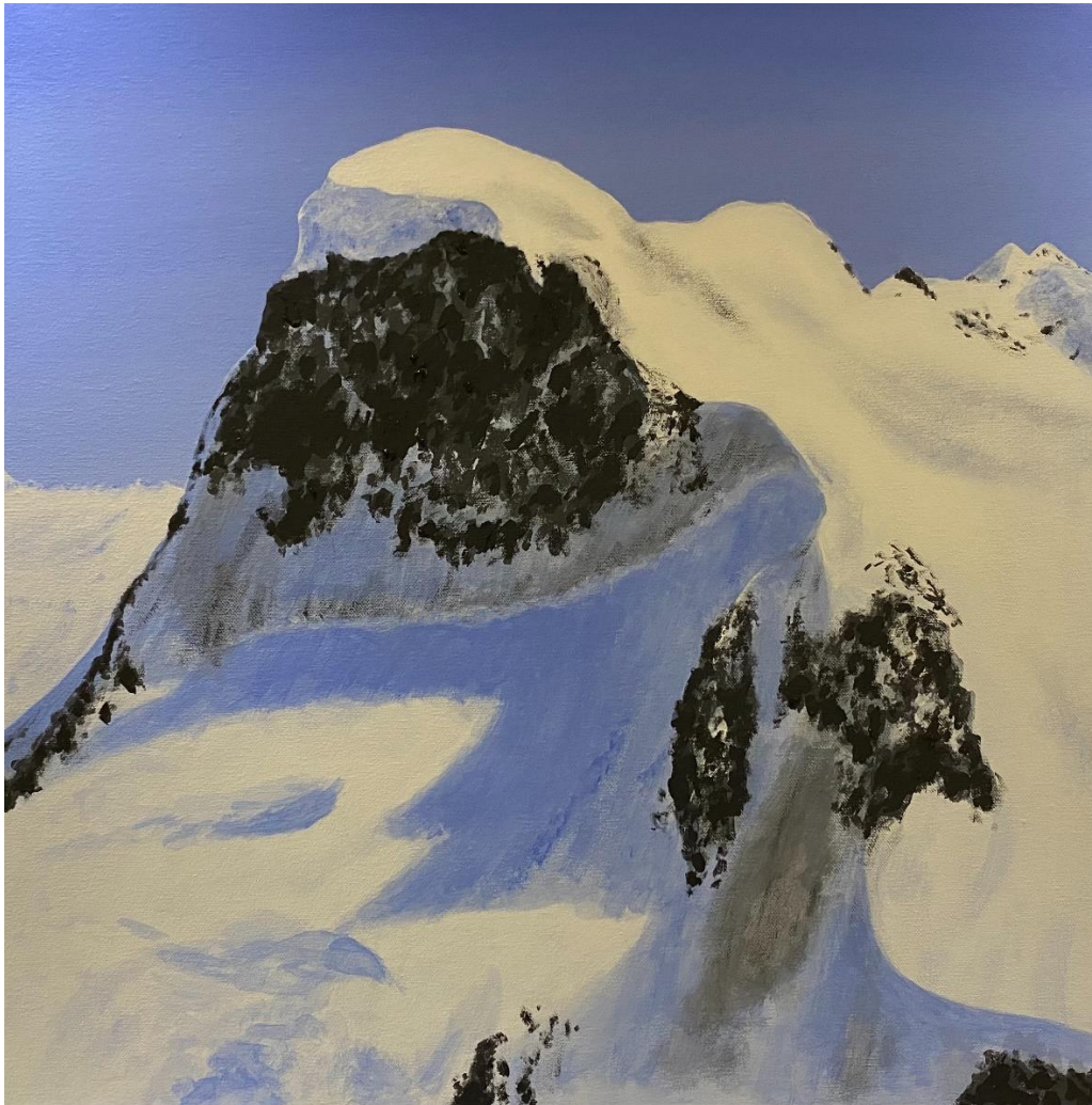
The Breithorn, Zermatt, Switzerland – Acrylic on canvas. Image size 60cm x 60cm

This is probably the most accessible and easiest 4,000m Alpine peak to climb but nonetheless a majestic mountain and one I have climbed in crampons and skis. The Breithorn is also one of the 4,000m peaks you can get very close to without climbing.