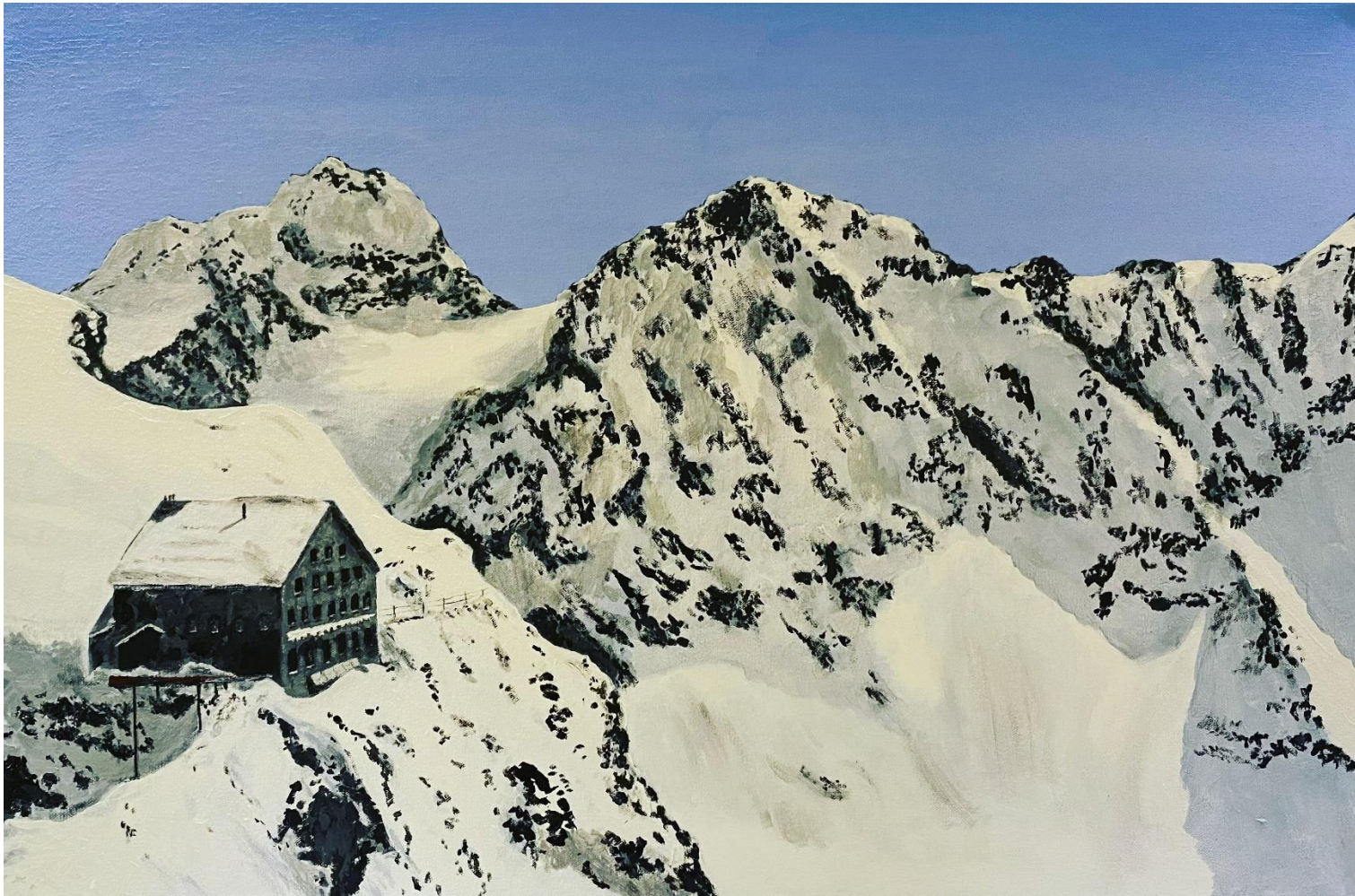
Vignettes Hut, Switzerland – Acrylic on canvas. Image size 91cm x 61cm