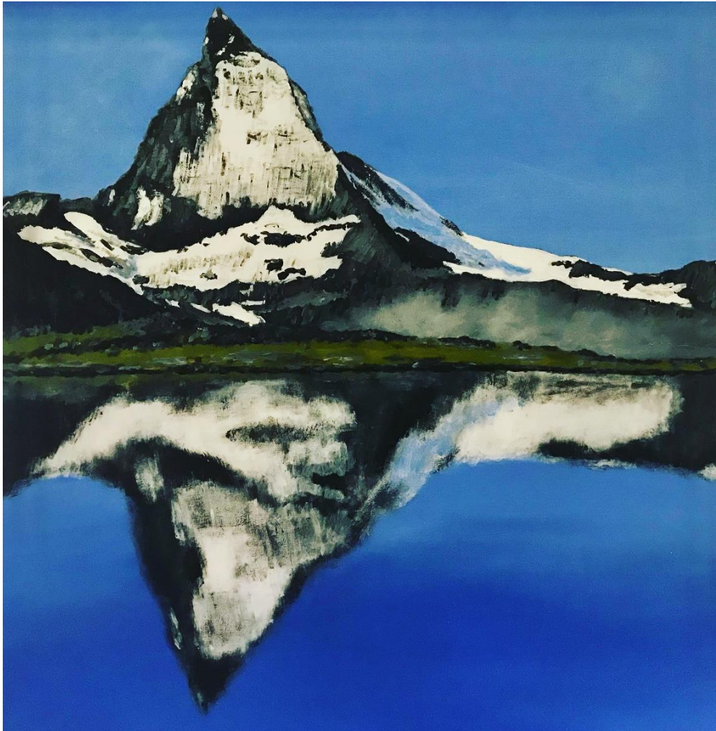
The Matterhorn from Lake Stellisee – Acrylic on canvas. Image size 100cm x 100cm

On the way to climb Monte Rosa, a long time ago now, we paused for a rest at Lake Stellisee. I was always struck by the reflection of the Matterhorn and was so pleased to get around to capturing it on canvas.