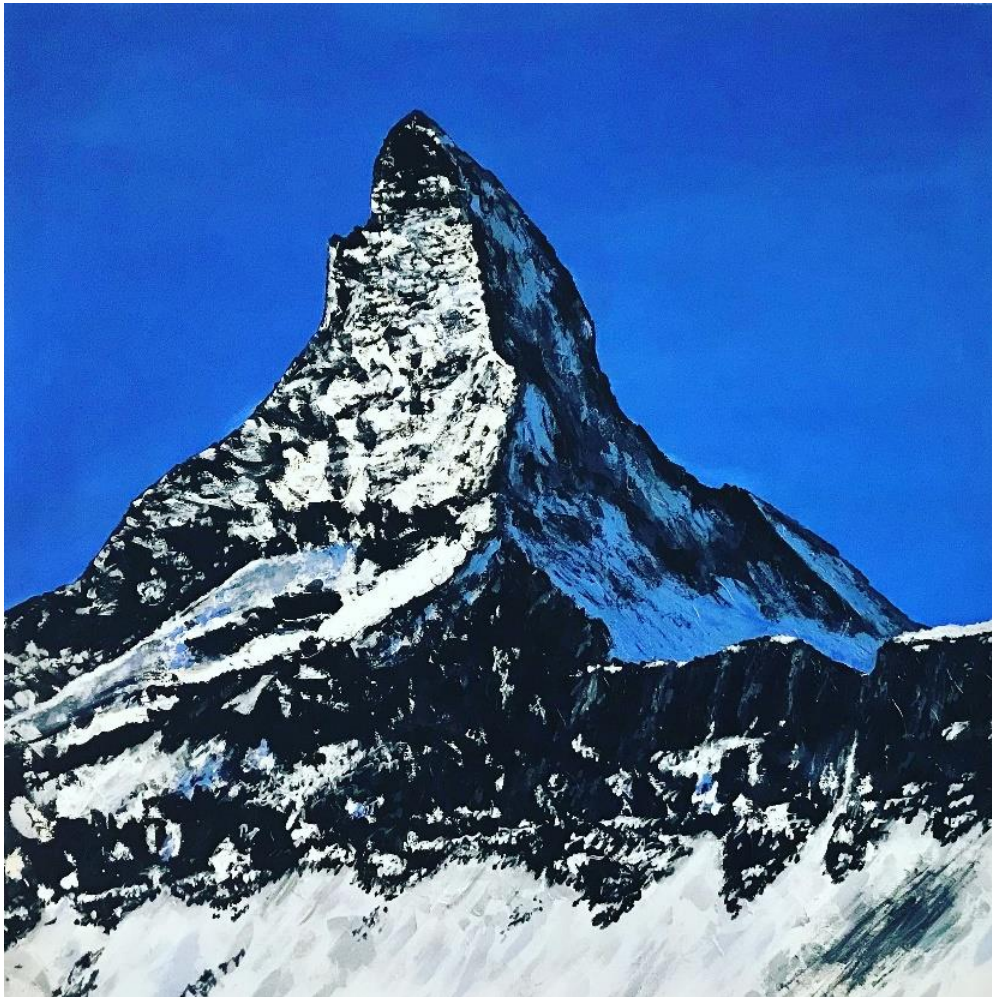
The Matterhorn, Zermatt - Acrylic on canvas. Image size 100cm x100cm

This is really the one that got away! I went to climb this mountain during the 90s' in two consecutive summers. Both times it was plastered in snow, even in the summer months. I still hope it could be within reach but to be sure I need to be in peak fitness and the ascent now requires by law a 1:1 support of a guide, let alone in favourable "condition". I hadn't seen it again in the "flesh" for 25 years until I happened to be back in Zermatt earlier this year (courtesy of the Covid restrictions in France). I spent the whole week looking at it and thinking what if....and yes the sky really was that blue!