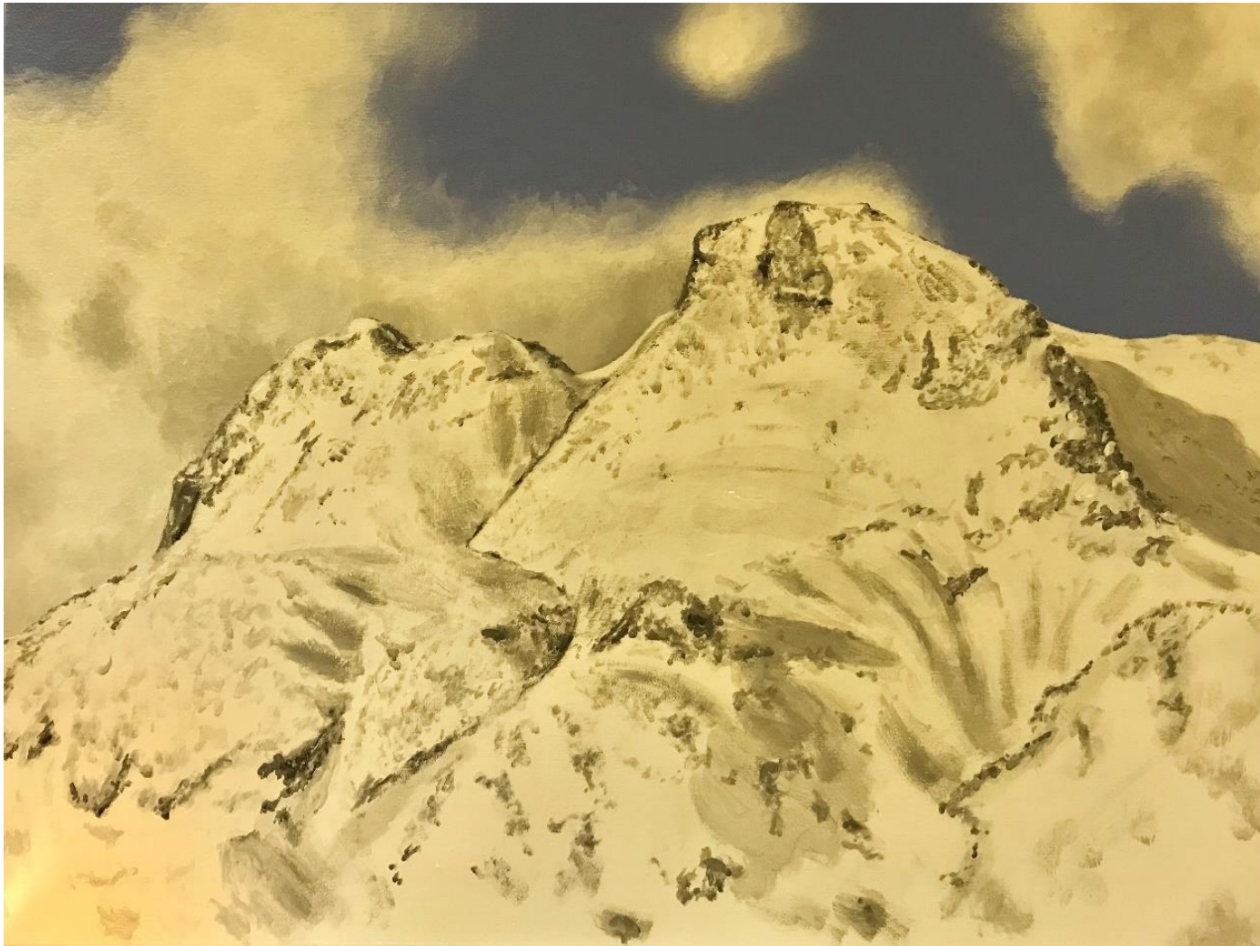
The Langdale Pikes – Acrylic on canvas. Image size 80cm x 60cm

So, how many times have I been up the Langdale Pikes? Not many is the answer! I always seem to bypass them heading for elsewhere but always enjoy the iconic view, especially this one, in winter.