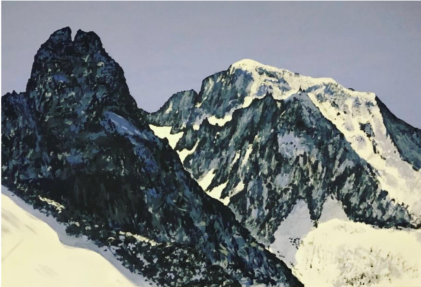
The Dru and Mont Blanc – Acrylic on canvas. Image size 150cm x 100cm

I climbed Mont Blanc in what now feels like a “lifetime ago” in 1994. I always imagined it would be the first of many 4,000 metre peaks for me although it turned out to be only a few. I like looking at them though and the Dru and its very distinctive outline has always held a special fascination for me. This one is a view of The Dru, the Aiguille du Midi and Mont Blanc from the Grand Montets ski slopes above Argentière, one of my favourite ski areas and the one I have visited most over the years.