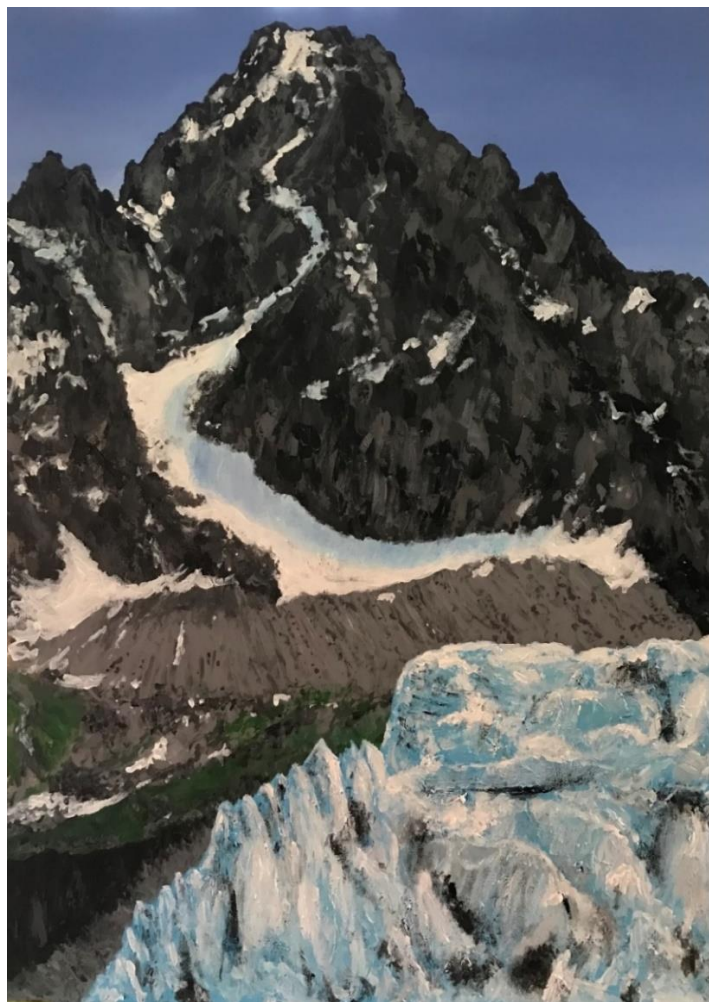
Glacier d'Argentière – Acrylic on canvas. Image size 60cm x 80cm

I have sat and gazed at the Argentière Glacier from Pointe de Vue, above the village of Argentière many times. I enjoyed capturing it on canvas. Sadly, in all the years I have been visiting the Chamonix Valley there has been a marked reduction in the size of the glacier.