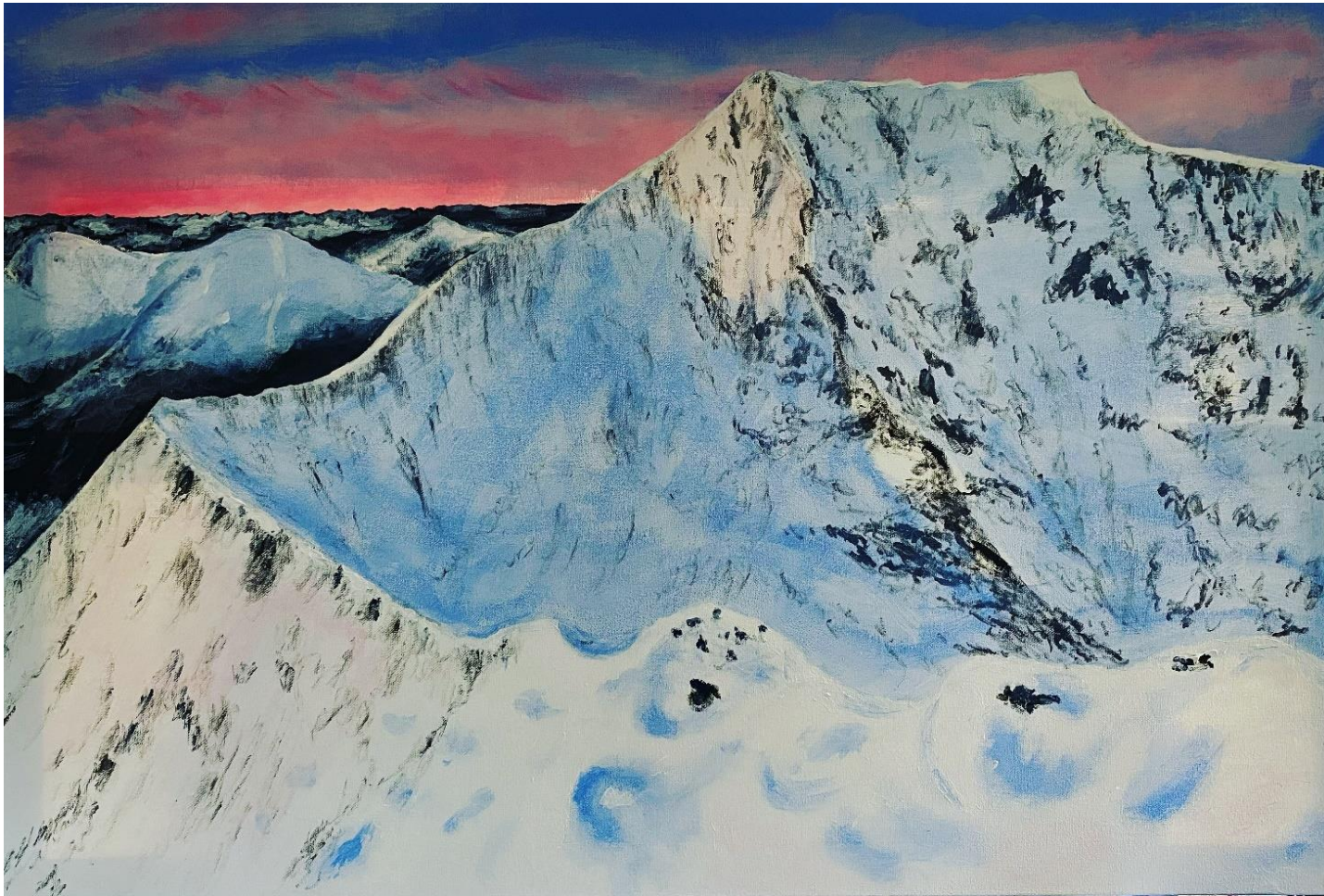
Ben Nevis North Face and Carn Mor Dearg Arête – Acrylic on canvas. Image size 92cm x 62cm

Probably my favourite ridge on the mainland UK is the Carn Mor Dearg Arete. It is, in my view, the most exciting way to access the summit of Ben Nevis, especially in winter. In the right conditions you could be forgiven for believing you are in the Alps. Only once has that happened to me – I'll never forget it, especially due to the fact I had to go six times before this happened!