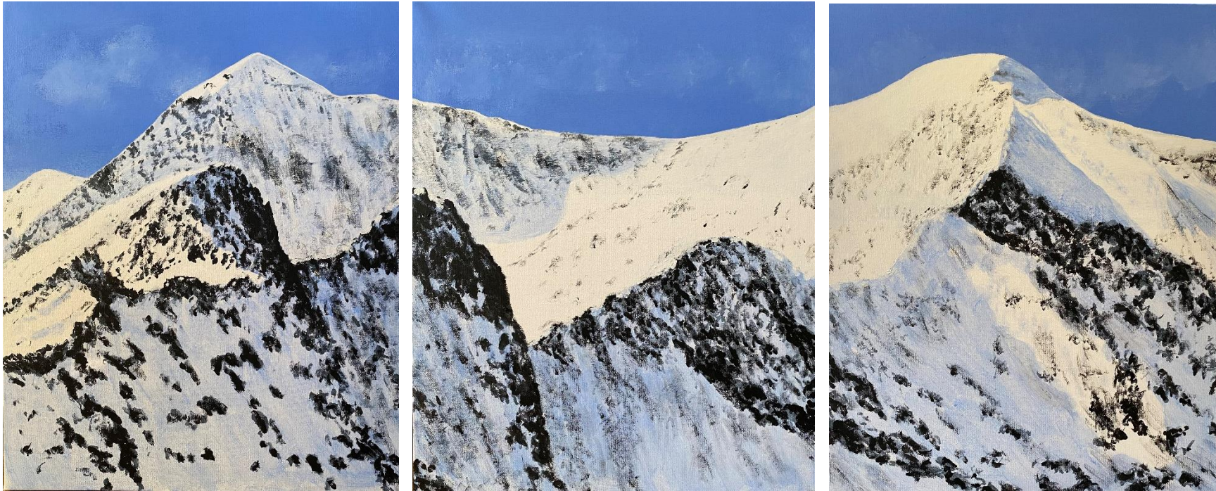
A triptych of Crib Goch, Crib y Ddysgl and Snowdon – Acrylic on canvas. Image size 46cm x 56cm each

On of my favourite days out in the mountains of Snowdonia. First, you experience the excitement of Crib Goch then a day of great views, if you are lucky. The route becomes a proper test of winter mountaineering skills in the snow and ice.