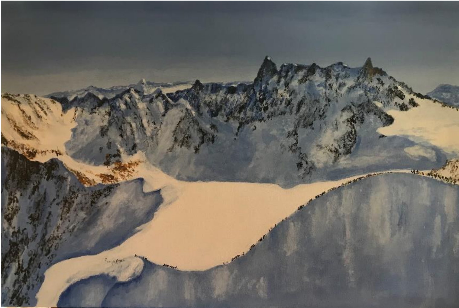
Arête de Aiguille du Midi – Acrylic on canvas. Image size 92cm x 62cm

I have been in the queue on the Arête from the Aiguille du Midi a few times. It is an exciting and interesting start to the World's longest off-piste ski run – 18kms and if you're lucky a ski down all the way to Chamonix. As I painted this, I was already looking forward to the next time. The arete is "protected" with ropes and stakes in the ski season but they are removed in the summer, making a descent a very different proposition. There are however no crowds in the summer!