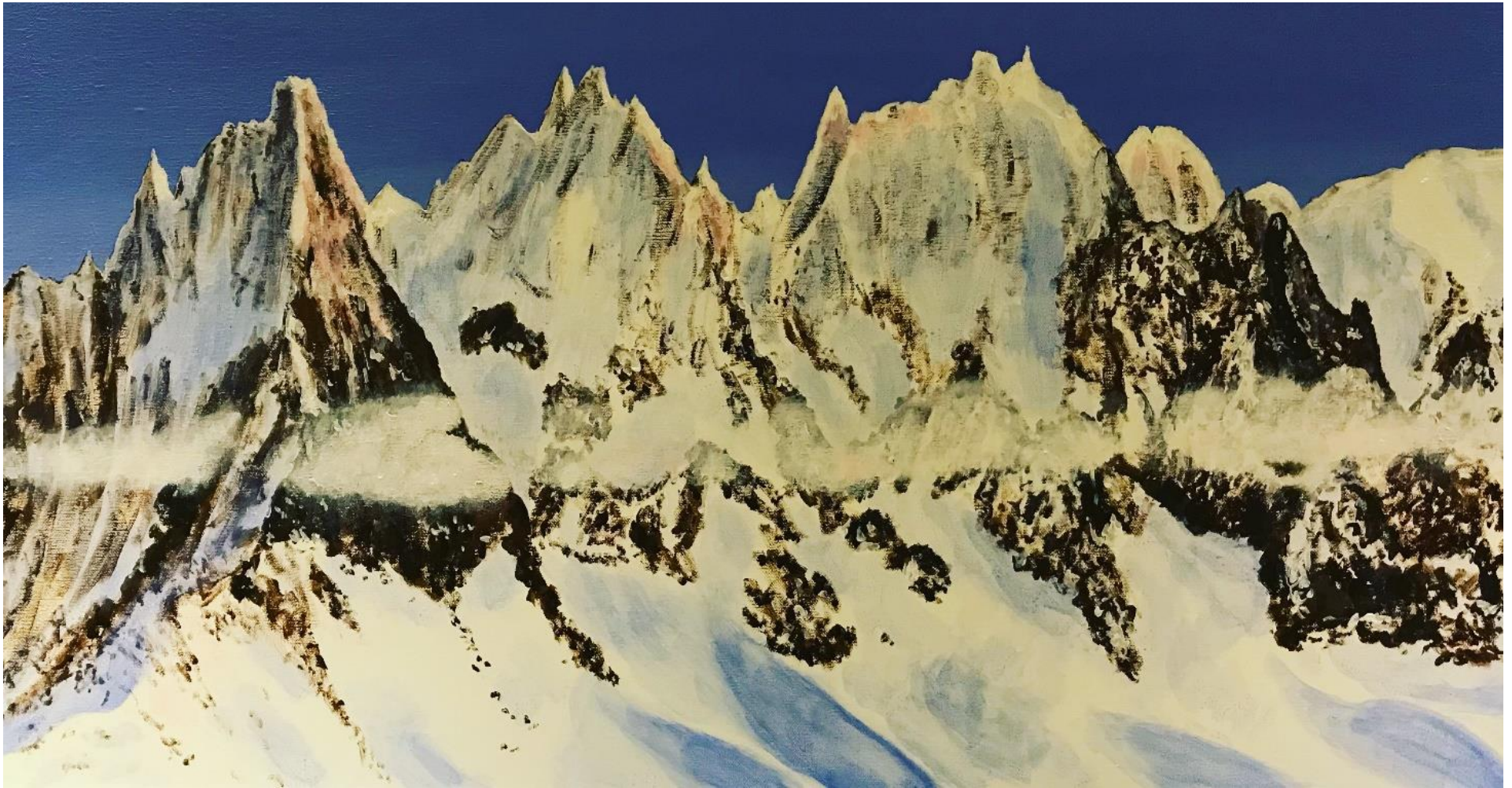
Aiguilles de Chamonix – Acrylic on canvas. Image size 100cm x 50cm

I have often observed the Aiguilles de Chamonix from the valley floor or from the other side of the valley while walking, climbing and/or skiing so just had to capture them from the many photographs I have taken over the years. Truly majestic!