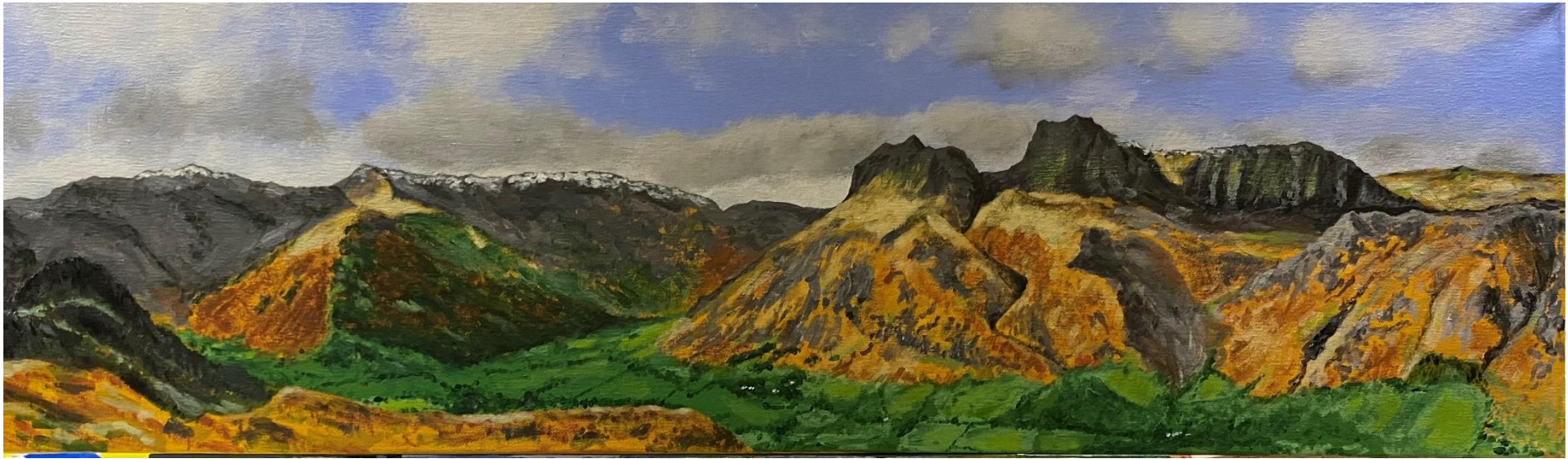
The Langdale Valley – Acrylic on canvas. Image size 100cm x 30cm

I love the Langdale Valley and all it has to offer. The starting point for many walks up the mountains either side or further afield, plus many climbing and scrambling opportunities. A great place to camp too – this is an iconic view showing the Pikes and Bowfell, amongst other peaks.